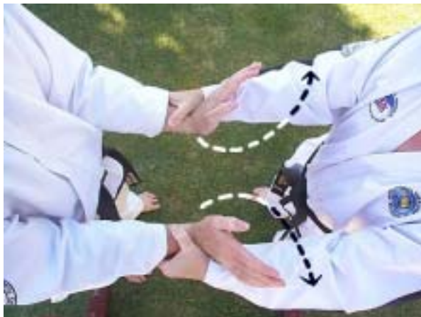
1. Move both wrists in an outward circular motion until both knife-hands are on your opponent's wrists or inner forearm.