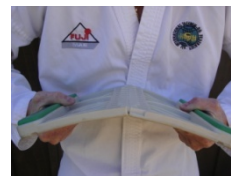
Big Bend before they break