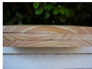
incorrect(middle board wrong)