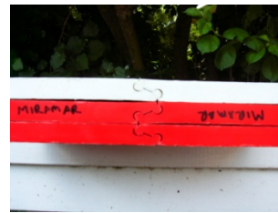
Incorrect(middle board facing wrong direction)