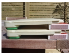
Big Gap Between Boards

These have lost favour over the years as they provide a completely different break to both the wood and Re-breakable boards, the gap between them when placed in a stack is too great, they bend substantially before they break and after a while the teeth break off creating a weaker board. Unlike Wood and injection moulded plastic you can push your way through a board with no speed at all. A good board for the beginner and kids as they don't hurt the attacking tool at all except maybe a bit of skin off the knuckles.