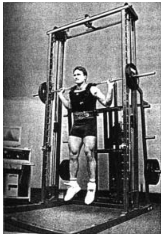
Fig. 8.29 Maximal power exercise: plyometric squats performed at the load which maximizes power output.

In essence maximal power training is a form of plyometric training that is performed at a specific load that maximises the power output of the exercise.