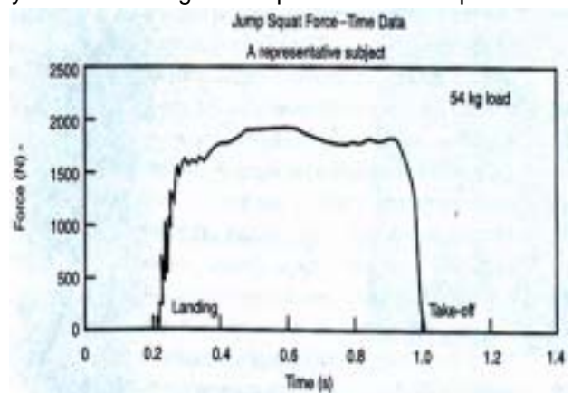
Fig 4 Force-time profile for a squat jump exercise performed at 30% of maximum (courtesy of Wilson et al , 1983).